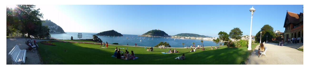
Figure 1: Magnificent view outside of Miramar Palace. The PODC community was enjoying coffee break and the sunshine!

The 34th 2015 ACM Symposium on Principles of Distributed Computing (PODC '15) was held on July 21-23, 2015, in Donostia-San Sebastián, Spain. The main conference and workshops took place at Miramar Palace , which sits on a small hill right across the La Concha bay and has a magnificent view of the beach. It is quite an experience to enjoy the beautiful beach after the talks. We start this year's review with birthday celebration, award ceremony, and business meeting, and then I summarize three inspiring keynotes. Finally, I review some talks that I found interesting and insightful.<sup>1</sup> I apologize in advance for talks that are not mentioned due to space limitations.