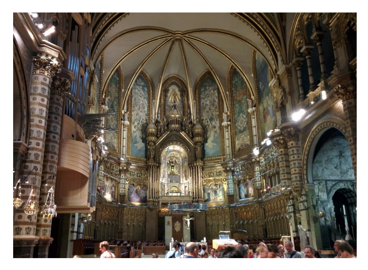
Figure 2: The social event was an organ concert in this basilica.