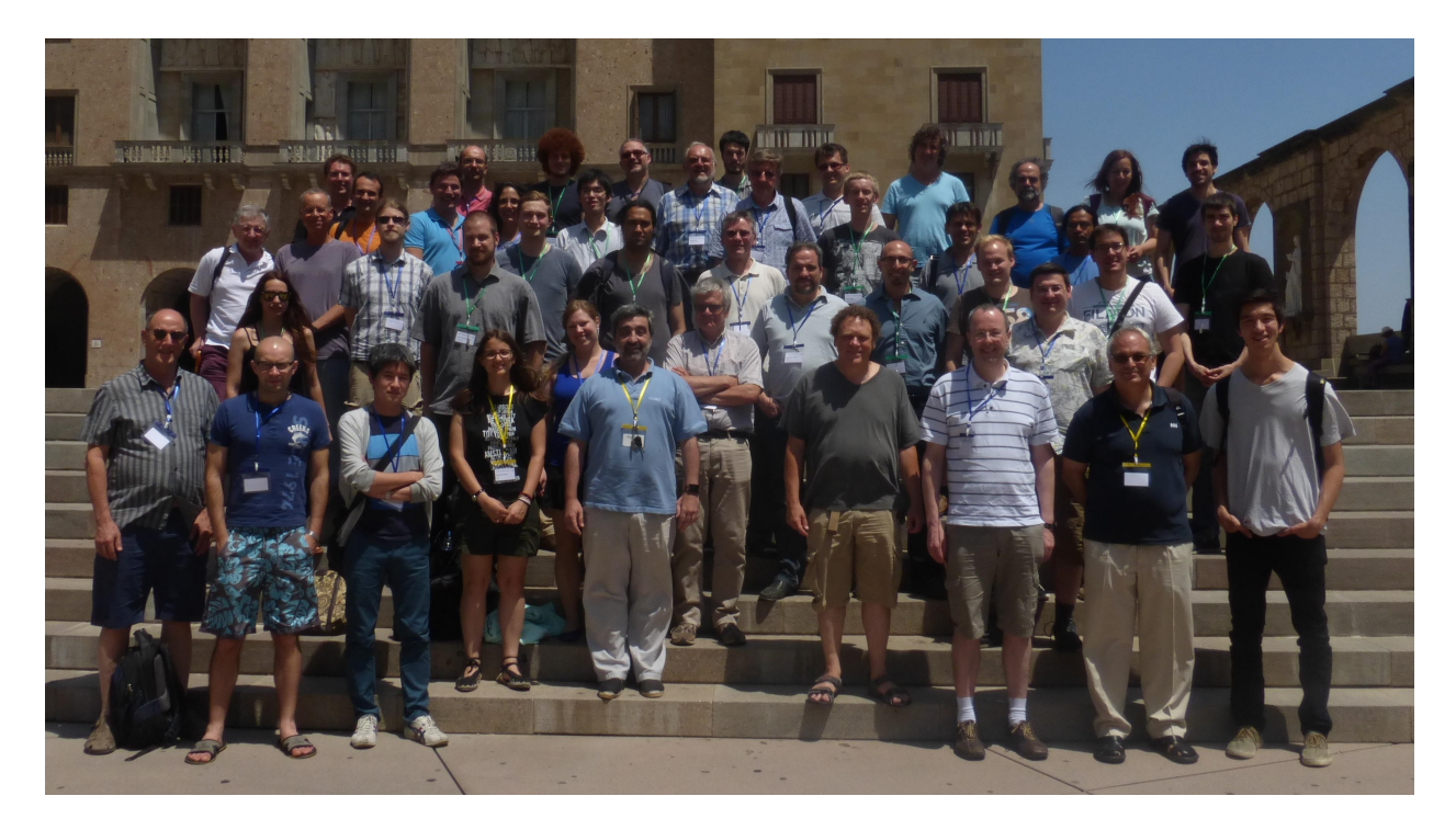
Figure 3: Participants of SIROCCO 2015

singleton components. Repeat O(\log n) times: Each component adds cheapest outgoing edge. Now, we merge the components by computing the low-congestion shortcuts first and then using these edges to communicate the merge process in time O(D \log D) . This leads to a distributed algorithm computing the MST in \tilde{O}(D) rounds in planar graphs which avoids the known general lower bound of \tilde{\Omega}(\sqrt{n}) rounds in the distributed setting. Bernhard's talk was quite inspiring and he was able to present the concept and proof ideas in a remarkable way. One of the last talks I heard on the conference was one of the best student papers presented by Katia Patkin. The topic was "Under the Hood of the Bakery Algorithm: Mutual Exclusion as a Matter of Priority" [10]. She analyzed the so-called Bakery algorithm by Lamport which solves the mutual exclusion problem where a process can enter a critical section (CS) such that all others processes are not allowed to enter the CS until the process leaves it. Thereby, every algorithm for the mutual exclusion problem induces a priority relation on the processes. Analyzing this relation can point to unnecessary blocking and waiting in the algorithm. By analyzing this relation of the Bakery algorithm, they were able to improve the algorithm, which they called Boulangerie, that does not suffer from unnecessary blocking.