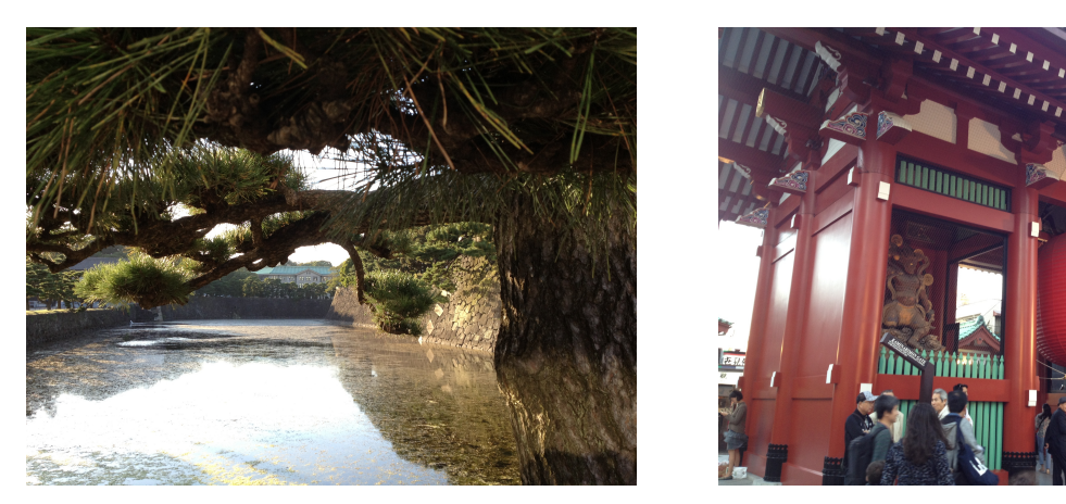
Figure 1: Left: View of Imperial Palace grounds. Right: Asakusa Temple.

After the talks we went on an interesting excursion which included the Imperial Palace grounds, the Asakusa Temple, and a cruise. The day ended at a special restaurant where we had a traditional Japanese dinner with excellent food that came mostly from the sea, and also practiced some DISC traditions as the best papers awards, Dijkstra Prize ceremony and the changing of DISC chair.